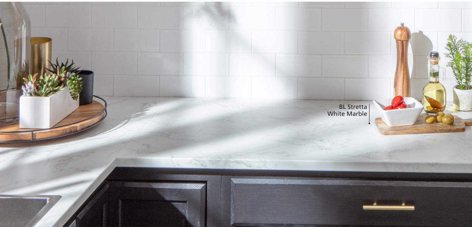
BL Stretta White Marble